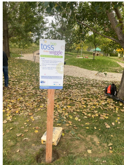
An example of one of the 10 activities to explore